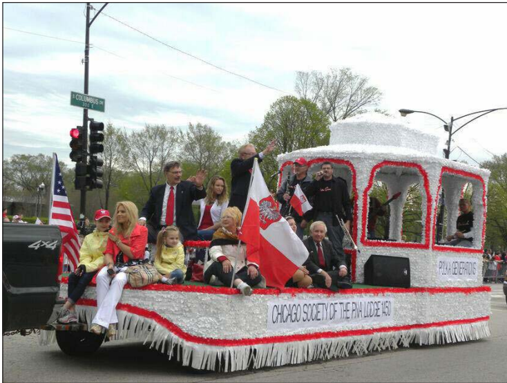
The float of the Chicago Society PNA in the Polish Constitution Day Parade on Columbus Drive, May 7, 2011