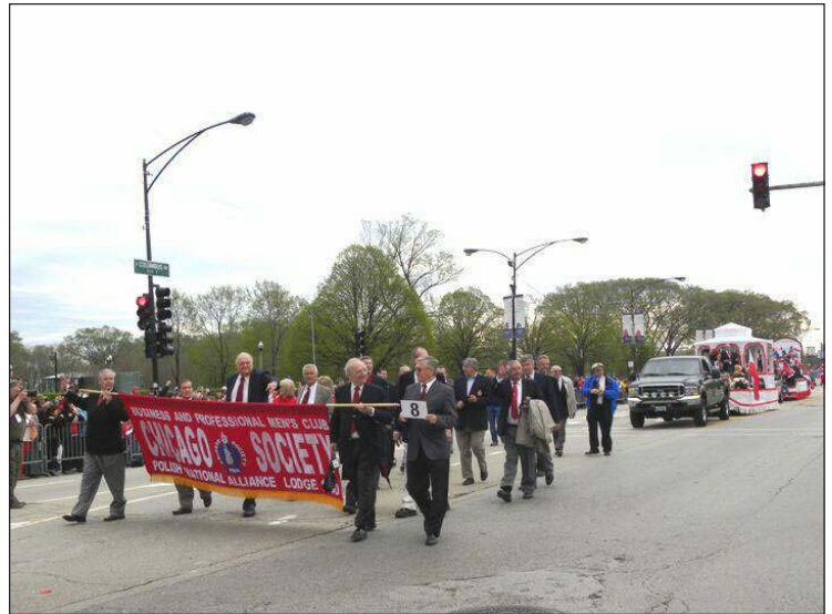
One of the Chicago Society's largest Polish Constitution Day marching contingents appeared in the parade